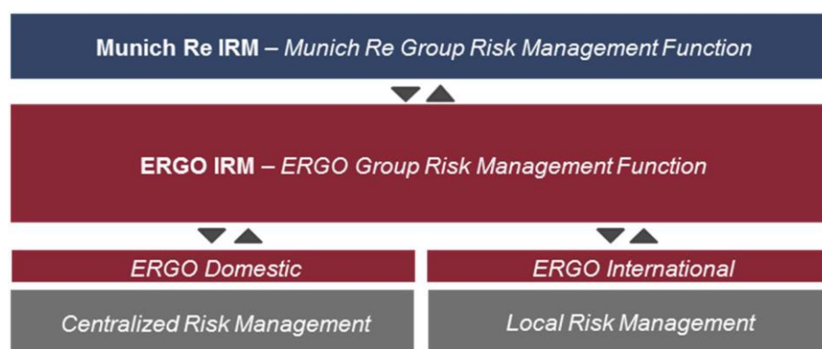
Figure 3. Risk Management Organization within Munich Re and ERGO Group

Methods, standards, processes and policies are defined by ERGO IRM in line with the overall Munich Re Group framework. Local risk management function is responsible for implementing the IRM methodology on a legal entity level. The Management Board of the Company is ultimately responsible for risk management.